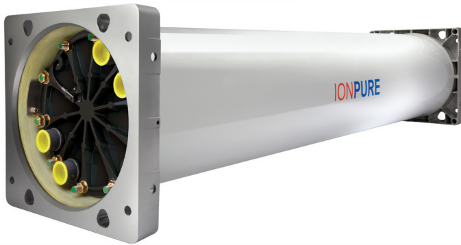
Ionpure® VNX Enhanced Performance High Flow Continuous Electrodeionization (CEDI) Modules